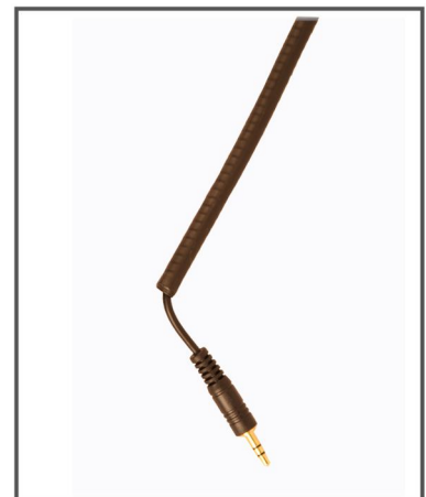
Extra Slack Extension for Cable