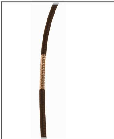
Steel Cable with Rubber Coating